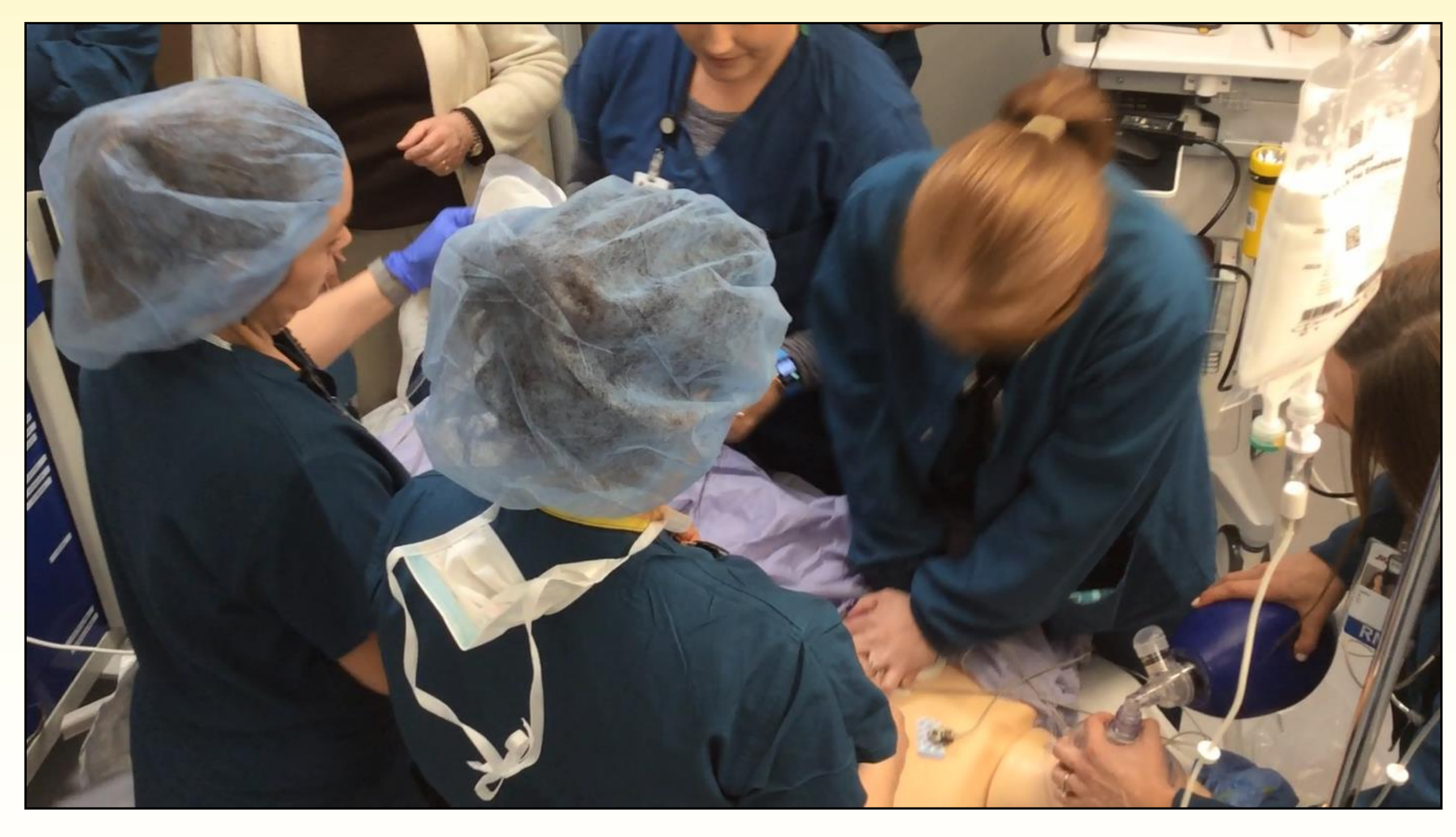
Mock Code in Action